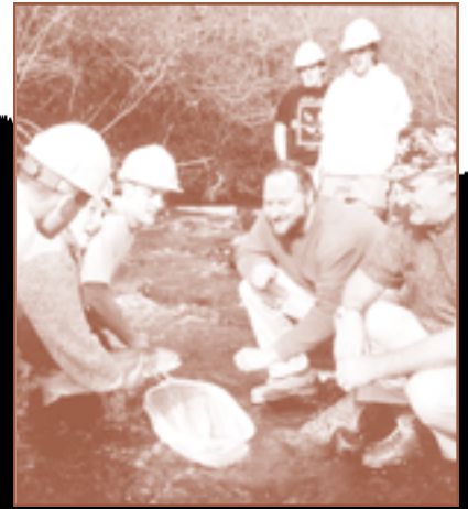
NOAA Fisheries Restoration Center

To address this threat, the President issued an Executive Order last year establishing an interagency Invasive Species Council to coordinate federal efforts. The council is developing a comprehensive plan to prevent the introduction of non-native species and to control those already here. Other recent efforts include a ban on the import of untreated wood packing material from China, the source of the Asian long-horned beetle infestation.