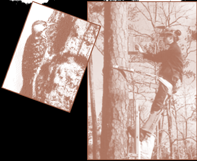
U.S. Fish and Wildlife Service